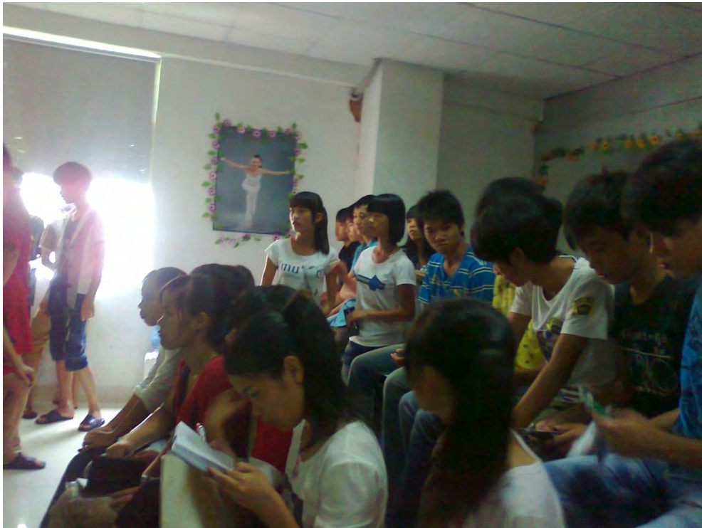
Student workers and child workers from vocational schools

Apart from child labor abuses, there are also significant defects in the management and remuneration of student laborers at HEG. Based on our investigation, the schools providing student workers to HEG in the long-term are Hunan Yuandong Vocational and Technical School, Chongqing Fuling Informational and Technical School, Guizhou Tongren Yanhe Secondary Vocational School , Chongqing Qijiang Vocational and Technical School, Guangdong Zhanjiang Chengyue Electronic School, Guangdong Zhanjiang Leizhou Sixth Middle School, Guangdong Zhanjiang Taiping Third Middle School, and Guangdong Huazhou Yangmei Middle School, and others.