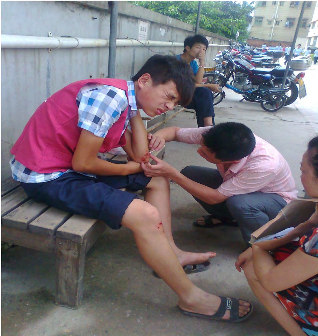
A worker injured on the job

The company's employees were neither familiar with the Environment, Health, and Safety Committee nor the orientation training about environmental safety. Because there were no tests given after training, employees would not pay much attention to the work safety lecture and thus lacked the awareness to protect themselves. At the same time, the company did not arrange any professional physical examinations for current or former employees.