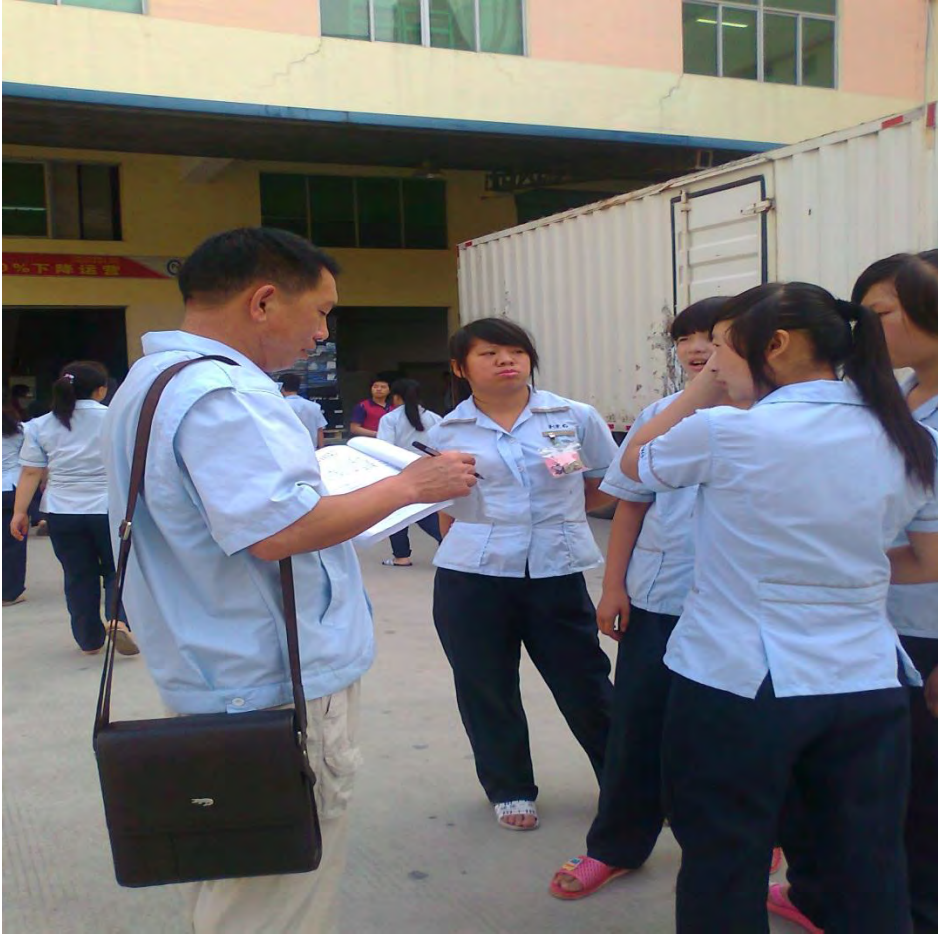
The teacher instructing students on intern issues