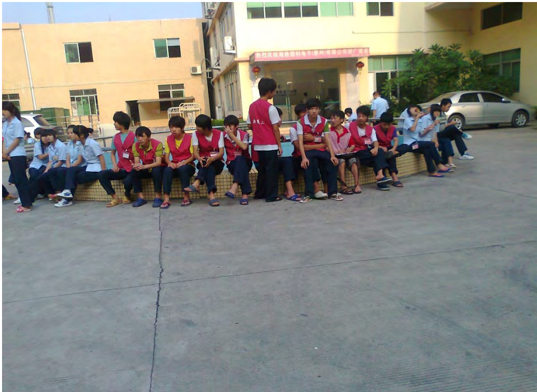
Student workers and child workers during break time