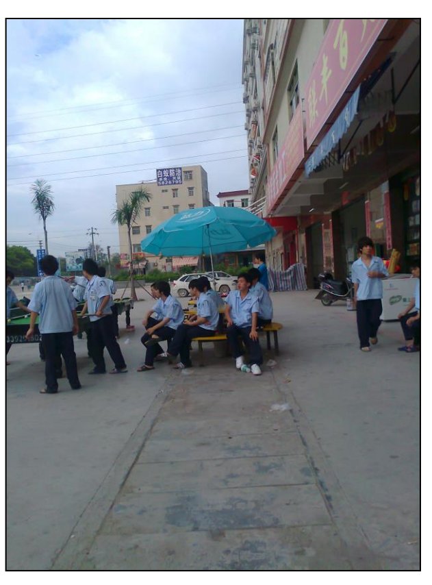
Workers outside HEG factory gate in 2012

The unit where the investigator was assigned is located in HEG's branch plant in the Hongchang Lida Industrial Park, some distance from the dormitories. While the one-way trip only takes about 10 minutes, workers have to wait a long time—30 or even 40 minutes—to get a bus, competing with many other workers for a seat. As a result, worker spend about two hours each day waiting for or taking the bus, adding more time in work-related activities despite workers' already