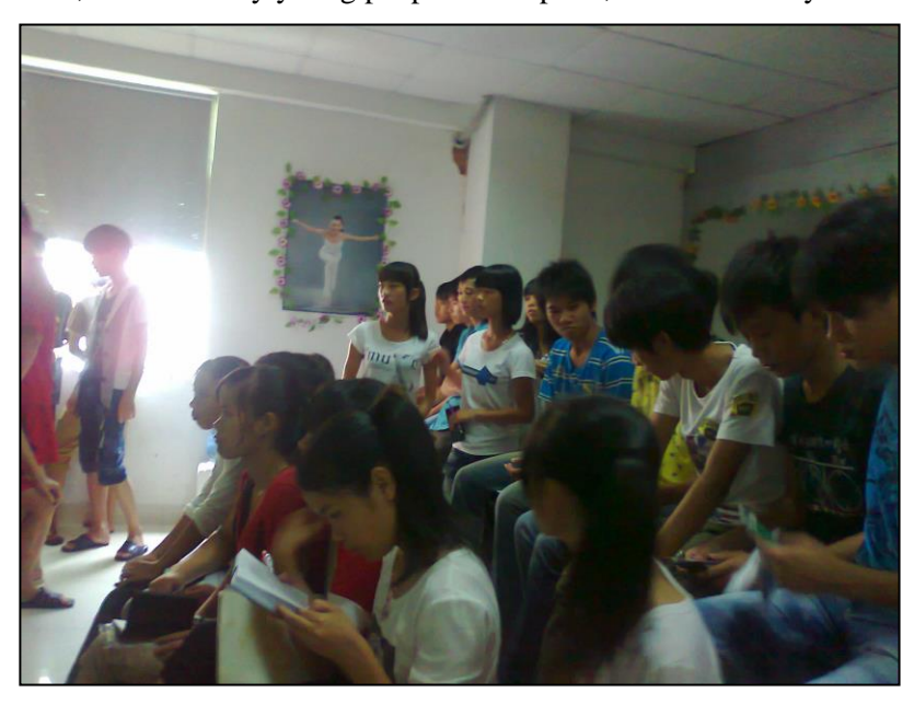
Underage workers at HEG in 2012

The Hongchang Lida branch plant of HEG employs underage workers (under 18) without special protections. Three such young workers were positioned near CLW's investigator in the workshop. Their working conditions and working hours were the same as adult workers despite national laws that require special