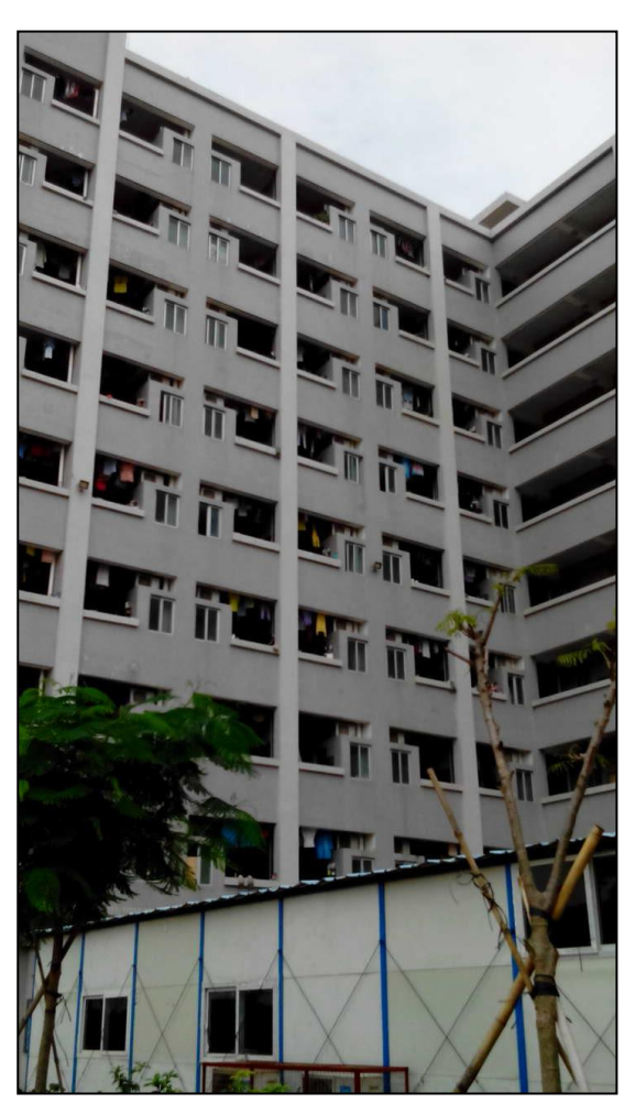
HEG housing in 2014

HEG provides subsidized meals for workers. For three meals per day, the factory assumes two-thirds of a worker's meal costs, while the worker pays the remaining third. For instance, if a worker pays 15 RMB ($2.36) for one day's meals, the factory will pay 10 RMB ($0.79) of that amount, and the worker will pay the remaining 5 RMB.