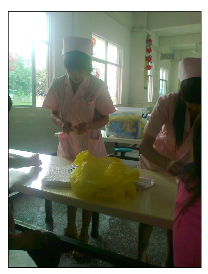
Blood is drawn in physical exam at HEG in 2012

After verifying the applicants' IDs, a number of forms are given to applicants, including a quiz that requires applicants to simply write at least the first five letters of the English alphabet and answer some basic arithmetic questions as well. After filling out forms, applicants take photos and give the company a copy of their IDs. Applicants finally receive a notice to return at 10 in the morning the next day with their belongings. The entire hiring process, from the moment applicants entered the HR office, only took about 20 minutes.