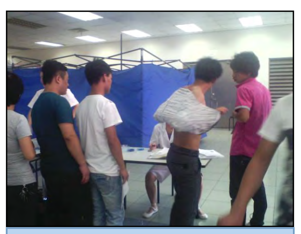
Workers were required to take off their shirts when receiving pre-employment physical examinations

Ninety percent of new workers signed labor contracts with different labor dispatch companies, and only a few workers sign contracts with QSMC's subsidiary companies, such as Dafeng and Dagong.