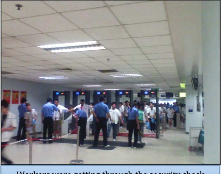
Workers were getting through the security check

Through interviews, CLW learned that workers at QSMC sometimes work for an entire week without any day off, which is illegal under Chinese labor law. During the roughly two weeks that CLW's investigator worked at QSMC, he had to work overtime on both Saturday and Sunday. This kind of overtime work is mandatory and workers have to wait until the second week to get a day off.