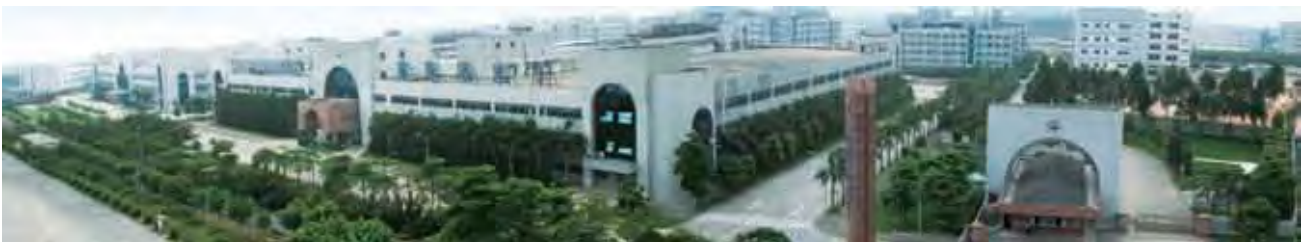
MSI Computer (Shenzhen) Co., Ltd. factory grounds

The focus of this report is the MSI production center, MSI Computer (Shenzhen) Co., Ltd.. The Shenzhen base is located in Tangtou Town, Shiyan, Shenzhen, Guangdong province. The factory was established in April 2000 and primarily manufactures motherboards and graphic image cards, and assembles components.