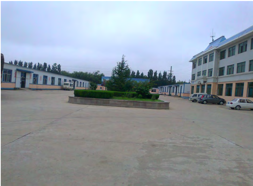
The factory environment