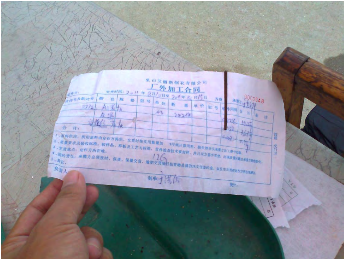
“Rushan Alice Garments Company Limited Outside Processing Plant Contract”