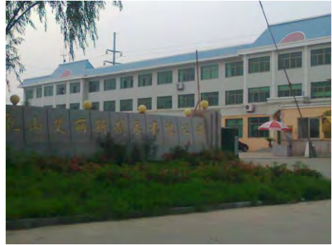
The front gate of Rushan Alice