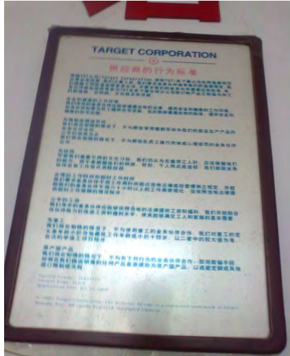
Target's Compliance of Standards of Vendor Engagement

Every workshop is equipped with a wall clock. At the end of a shift, after every production worker sorts out the fabric from the finished clothing, the workers may leave.