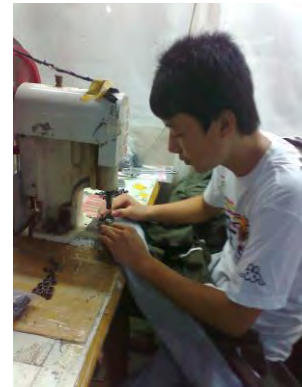
Teenage worker without safety equipment

Manufacturing workshops have emergency first aid kits, but they are usually locked. Workers were not sure whether or not the first aid kits contained any medical supplies.