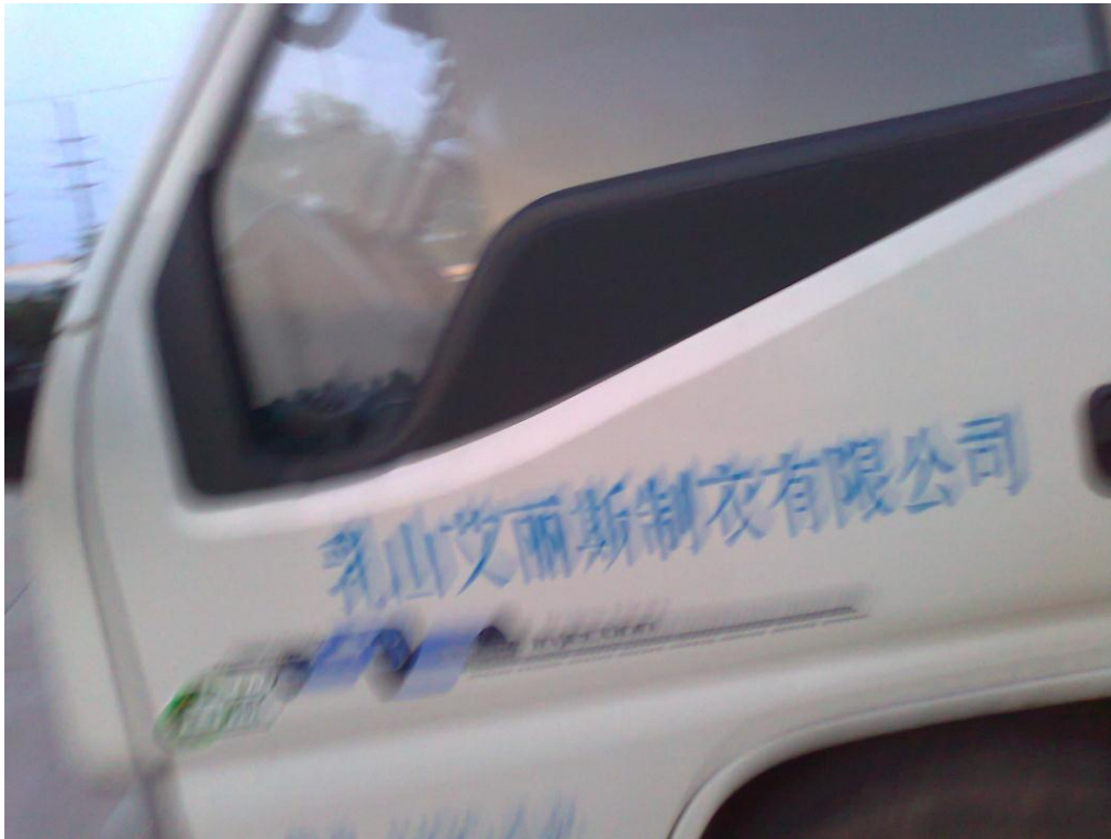
Rushan Alice Garment Co., Ltd. Truck