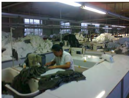
Workers sewing in the factory.

Once hired, workers begin working under a three month probationary period. After completing a three month probation period, workers are given the opportunity to sign a one-year labor contract with the factory. Workers are not provided with a duplicate copy of the labor contract for their own records. Interviewed workers told investigators that labor contracts were a simple formality merely for the sake of deceiving factory inspectors and passing factory audits. Workers are required only to sign their name to make the contract binding. They are not provided with any explanation in regard to its content or given the opportunity to more closely examine the contract.