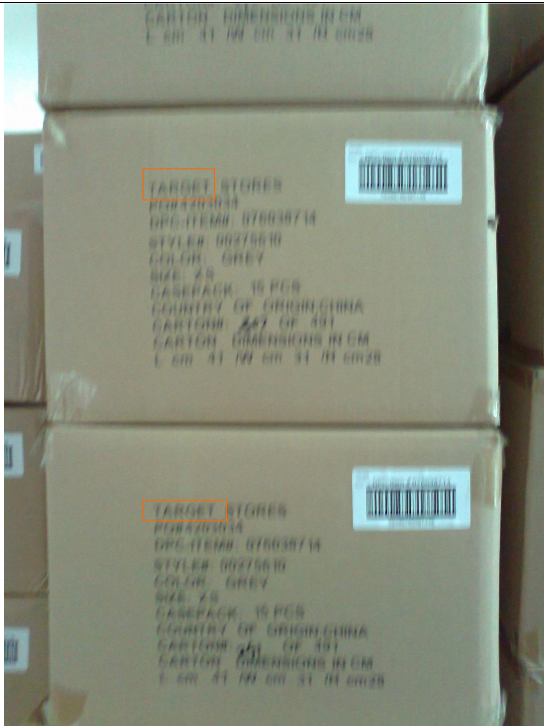
Closer look at Target's shipping boxes.