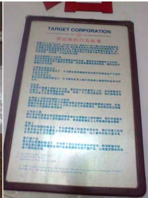
Target's Standards of Vendor Engagement