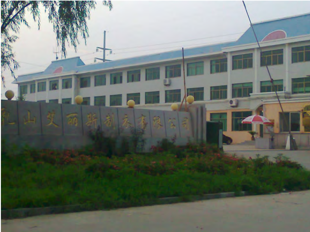
The front gate of Rushan Alice Garment Ltd.