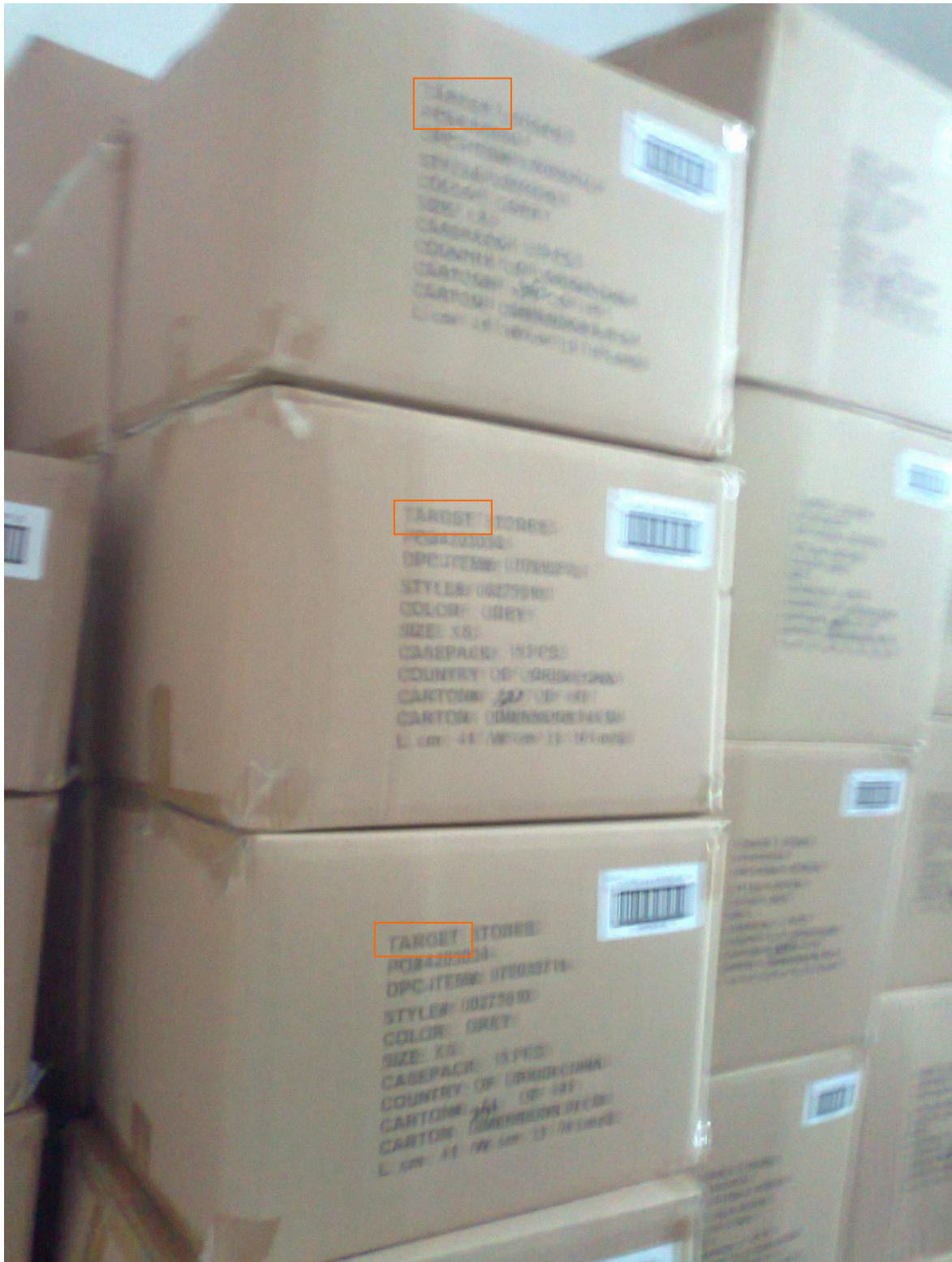
Target's shipping box. Our investigator saw the products he personally produced and the outsourced products put in these boxes.