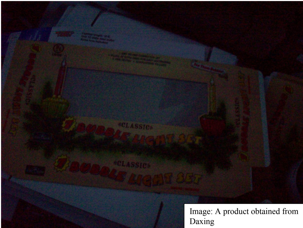
Image: A product obtained from Daxing

There is no union at Daxing. Although complaint boxes are installed by the stairway on each dormitory floor, very few workers would utilize such a system to express their concerns. From their perspective, this system is useless as no one ever checks the boxes.